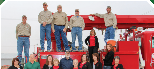
District 1—Scott City