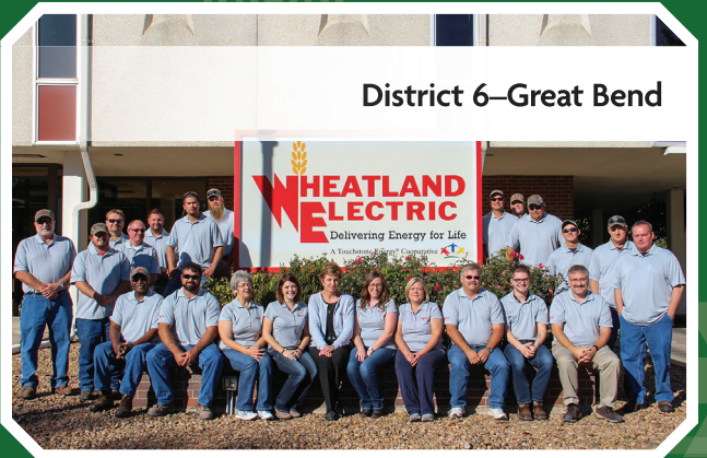
District 6—Great Bend