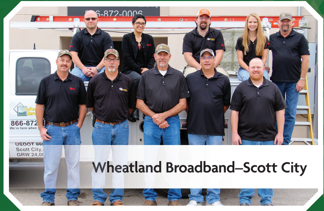
Wheatland Broadband—Scott City