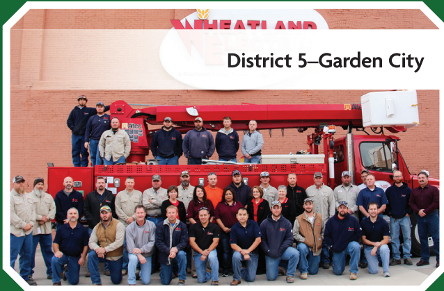
District 5—Garden City