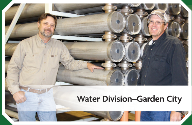
Water Division—Garden City