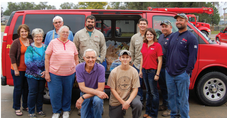
Above: Employees from Wheatland’s Great Bend office present the Barton County Food Bank with 1,320 pounds of donations.