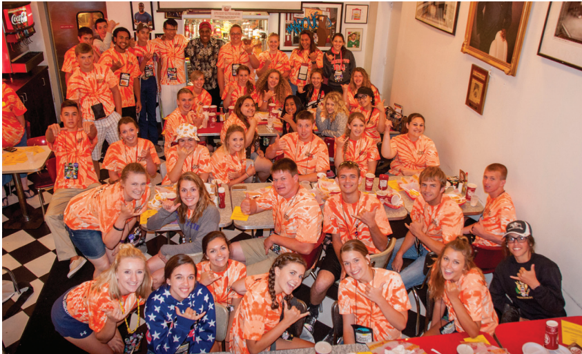
Each year, students from Kansas join more than 1,700 youth in Washington, D.C., to attend the Electric Cooperative Youth Tour. Next year's Youth Tour is scheduled for June 8-15, 2017.