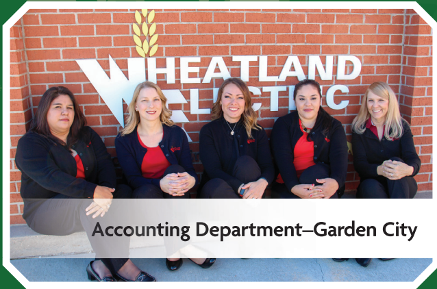
Accounting Department—Garden City