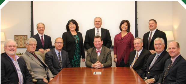
General Manager & Trustees