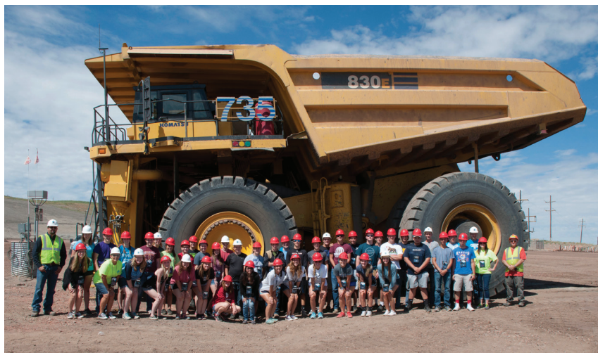
During the 2016 Cooperative Youth Leadership camp, Kansas and Oklahoma campers tour Trapper Mine, located in Craig, Colo., where coal is mined to fuel three local generation plants.